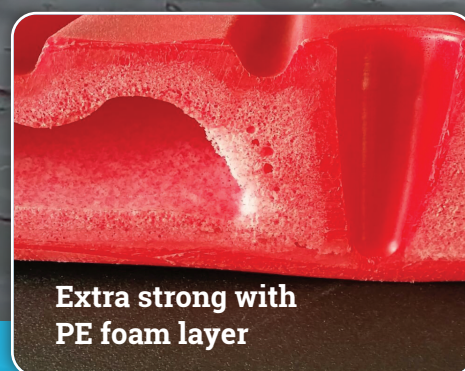
Extra strong with PE foam layer